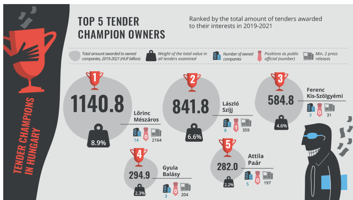
Graph 2 – TOP 5 owners

Source: TI Magyarország's calculations based on self-collected information, data from Dun&Bradstreet and K-Monitor / Infographic: Infotandem