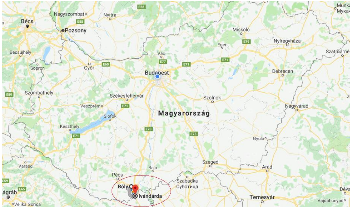
Bóly and Ivándárda on a map of Hungary

The first phase of the project's implementation started on 23 December 2016 with the initiation of public procurement procedures for the preparation of permit and design plans, and the acquisition of a binding construction permit. In the course of the public procurement procedure, TI reviewed the documents and specific procedural acts of the process from the perspective of transparency, legality and the ensuring of fair competition.